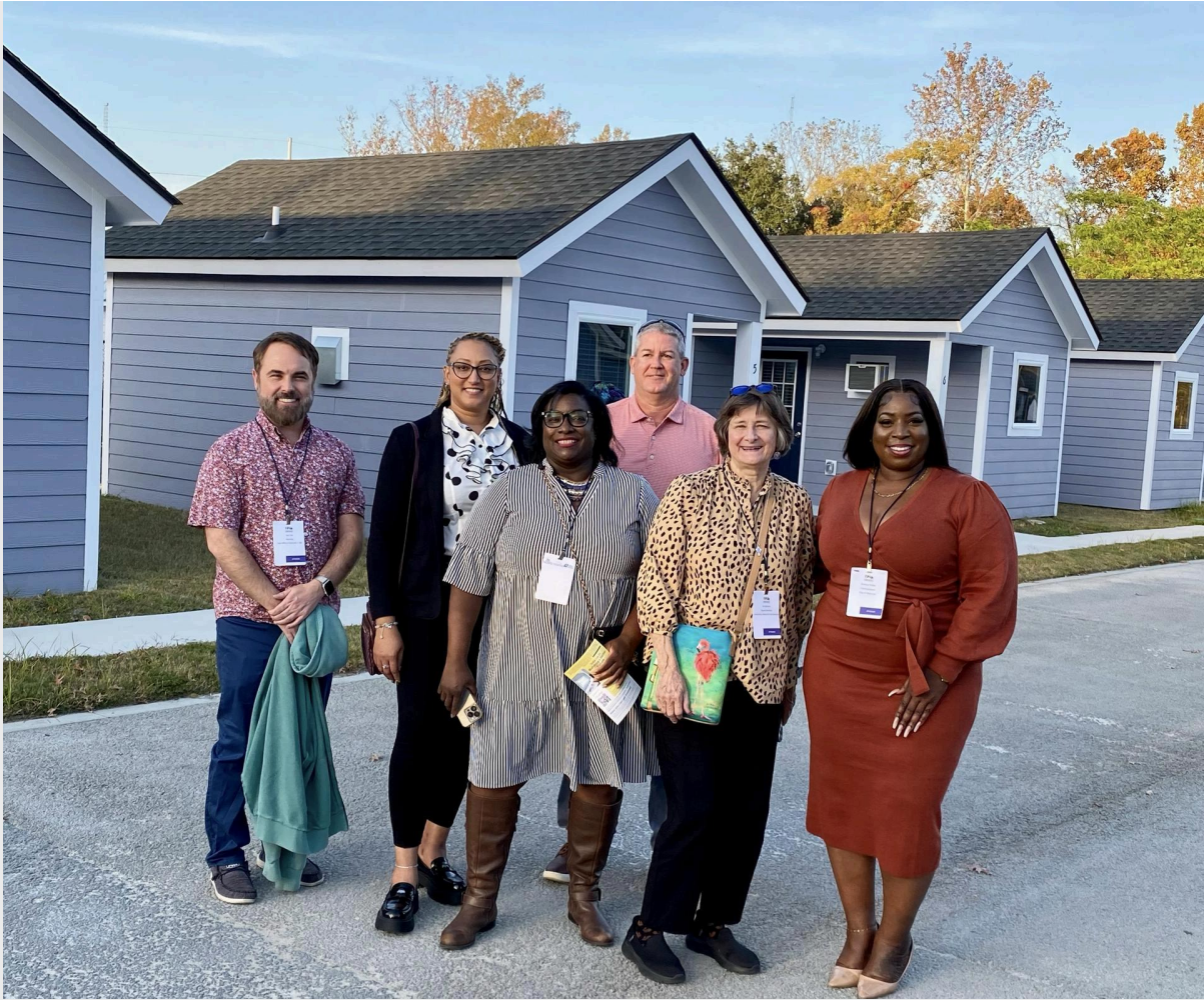
The Waycross/Ware County Georgia Initiative for Community Housing (GICH) group joined the CHSA Trolley Tour of Housing Opportunities during the Fall DCA conference in Savannah on November 20.