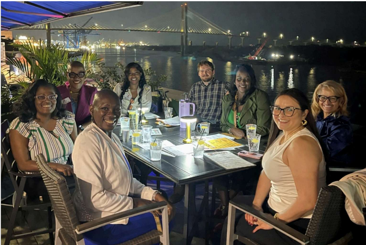
The Trolley Tour of Housing Opportunities team celebrates after the event on the Riverfront. What a beautiful city we live in!