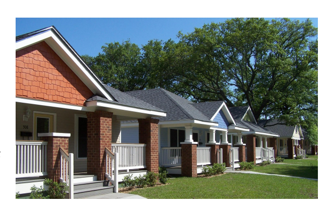
Find out more!

Federal Home Loan Bank - Atlanta has up to $15,000 for qualified buyers. And through the Georgia Dream Homeownership Program, they may qualify for up to $12,500 more. CHSA stands ready to help with financing and technical assistance. Call 912-651-2169!